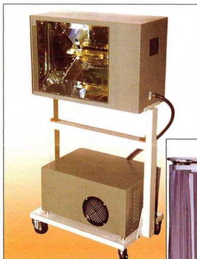
RAPID 5 kW

The energy saving system for fast results.