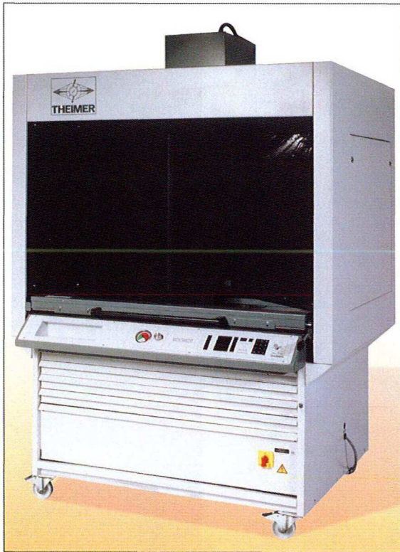
MONTAKOP with cabin