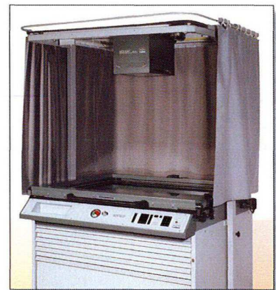
MONTAKOP with curtain

The automatic diffusion foil, plus TURBOSPEED vacuum system, KR-Computer, optimised light source, useful drawer storage unit, and last but not least, the overall construction quality, guarantees many years of trouble free service in operation.