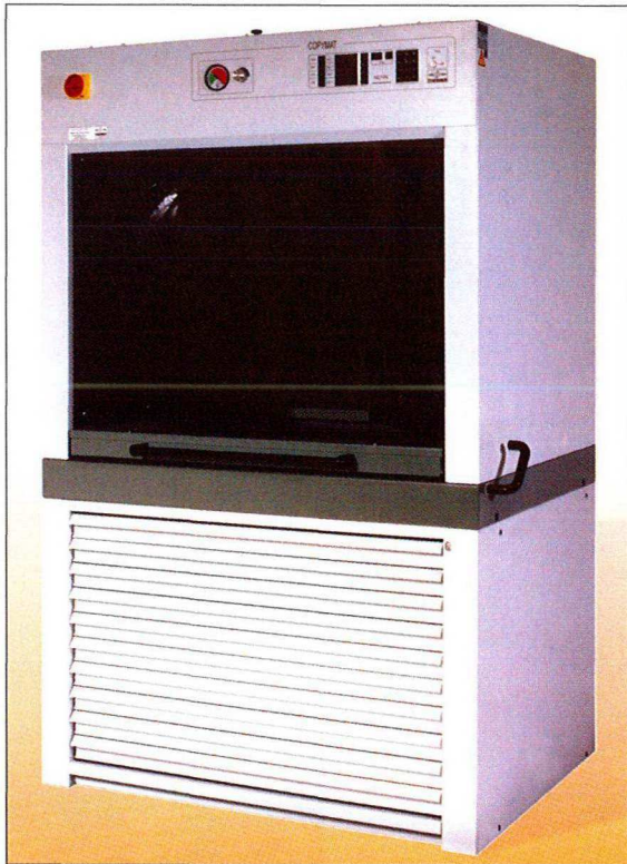
COPYFACE with drawer storage cabinet